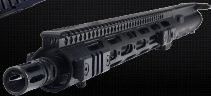
15" MWI Modular Rail