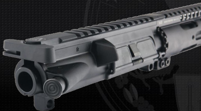
Mil-Spec Forged Upper Receiver