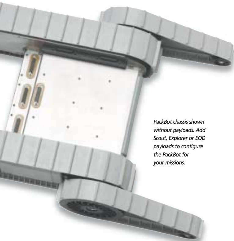
PackBot chassis shown without payloads. Add Scout, Explorer or EOD payloads to configure the PackBot for your missions.

"The (PackBot) proved to be a capable, reliable, and robust platform." – Independent test ran by Southwest Research Institute (SwRI), Small Robotic Vehicle Test Bed, June 2001.