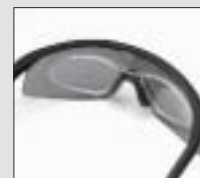
Optional Rx insert