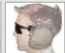
Sawfly STP Protective Eyewear Fits under headsets preventing noise leakage.